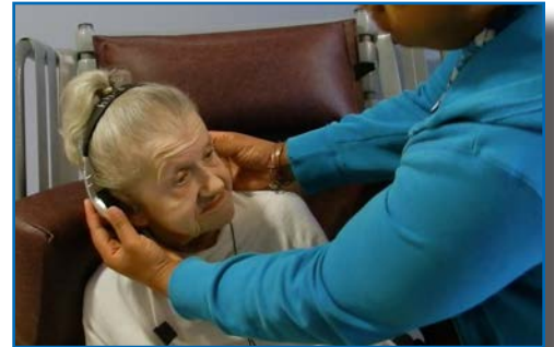
Improving quality of life for individuals living with dementia, by using Music and Memory interventions.