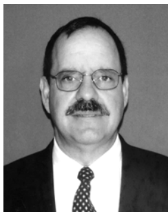
Hugh J. Morgan Chair