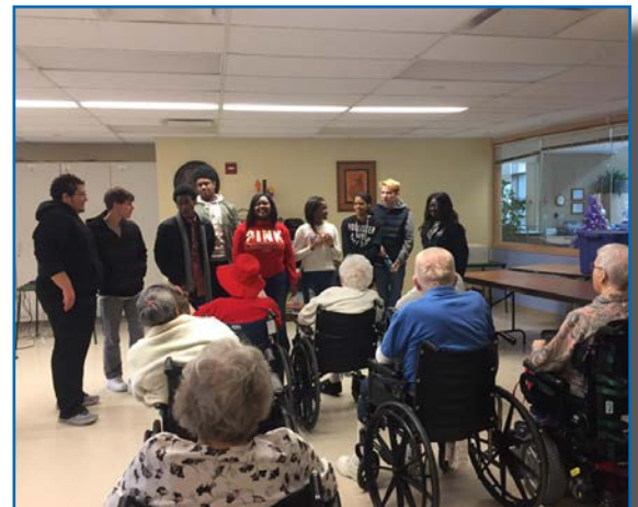
Together with students from Garfield Heights High School, Jennings residents participated in lifelong learning events such as a speaker about the role of forensic science in Cleveland's most notorious detective cases.