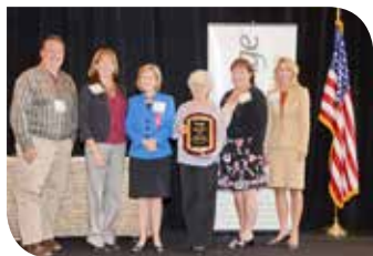
Discovery of Potential