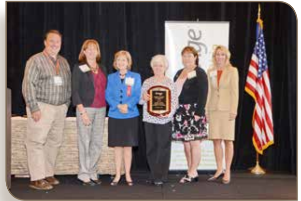
Staff from Jennings Center for Older Adults and Hospice of the Western Reserve earned recognition for the Western Reserve Navigator at Jennings program to support older adults in successful aging.