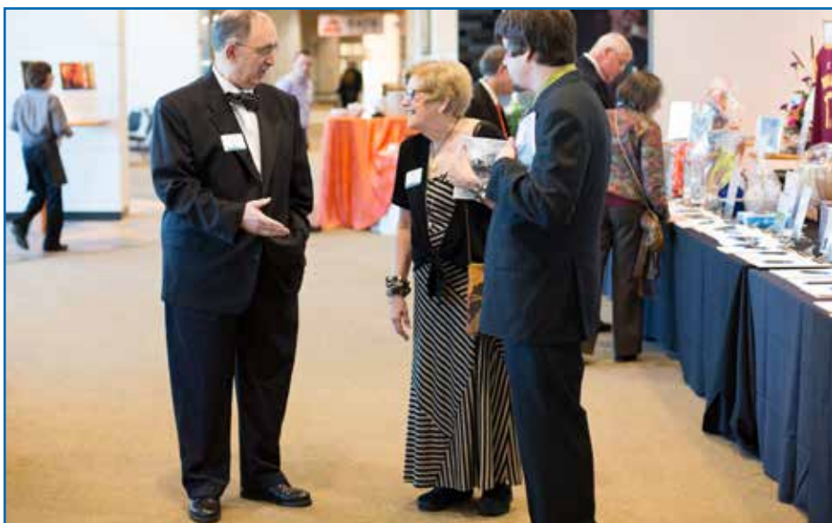
Donors make a difference! Attendees of Jennings' Spirit and Splendor fundraiser help Jennings to provide quality care for older adults.