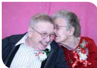
Celebration of Life