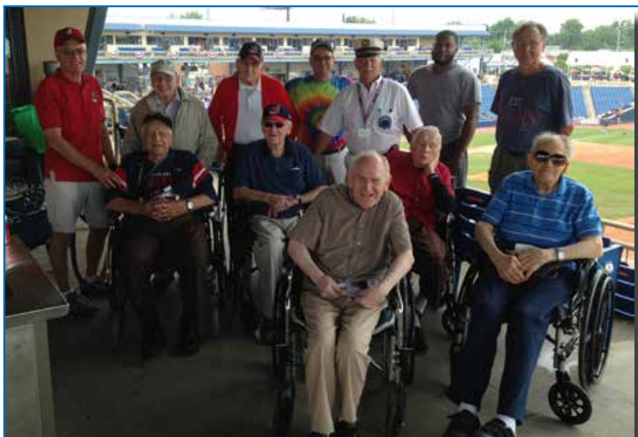
Donors make a difference! Some of Jennings' Men's group, volunteers and families enjoyed baseball fun with the Lake County Captains.