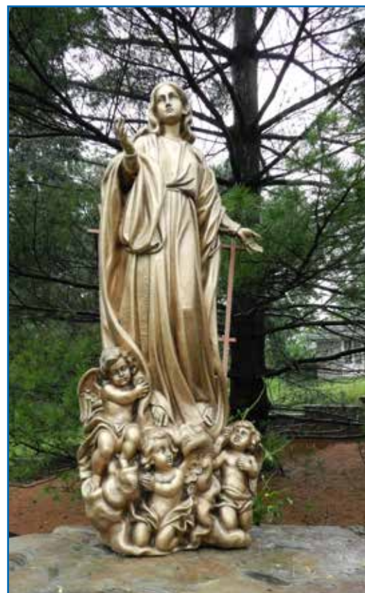
Donors make a difference! A statue portraying the Assumption of Mary was donated and dedicated at Paraclete Park in July 2013.