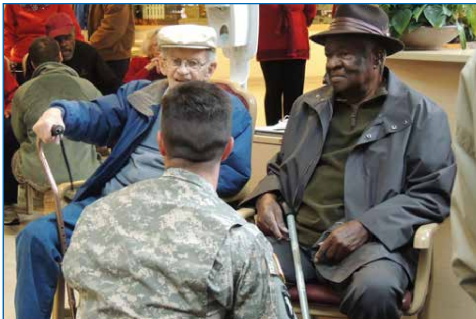
Volunteers make a difference! On Veteran's Day, veterans are honored with a flag ceremony, ceremonial gratitude pinning, and lunch served by John Carroll University ROTC participants.